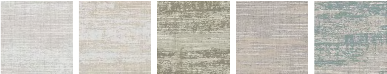
CD2-GHO-01 Cirrus Cloud CD2-GHO-02 Cement Mix CD2-GHO-03 Lichen You CD2-GHO-04 Sustainable CD2-GHO-05 Oar