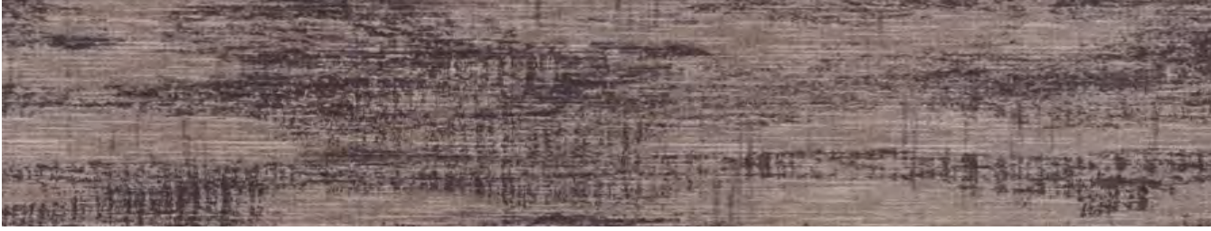
CD2-GHO-16 Carbon Star