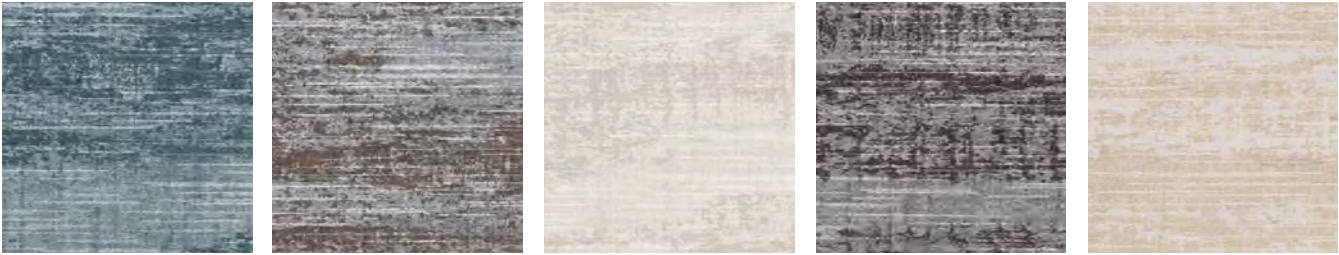
CD2-GHO-06 Ionian Sea CD2-GHO-07 Arctic Char CD2-GHO-08 Varnished White CD2-GHO-09 Nocitlucnt CD2-GHO-10 Indigenous